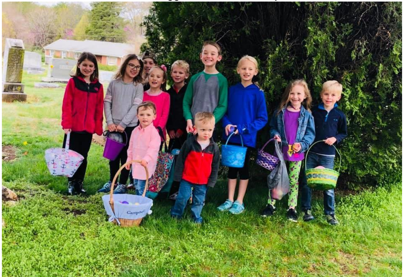
Easter egg hunt 2020 memory