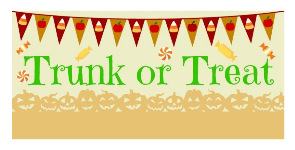
The Church will host a Trunk or Treat in the Church parking lot on October 30 from 6-8 p.m. Please join us!!