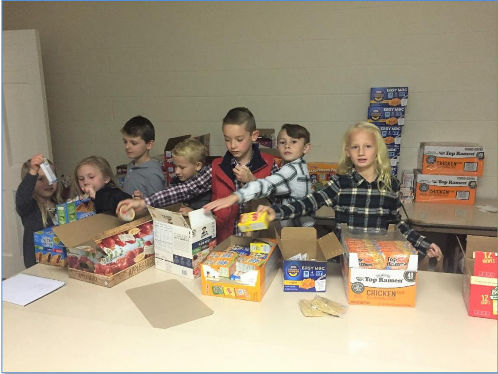
THE KIDS ARE ENJOYING SNACKS DURING THE KIDS WORSHIP TIME